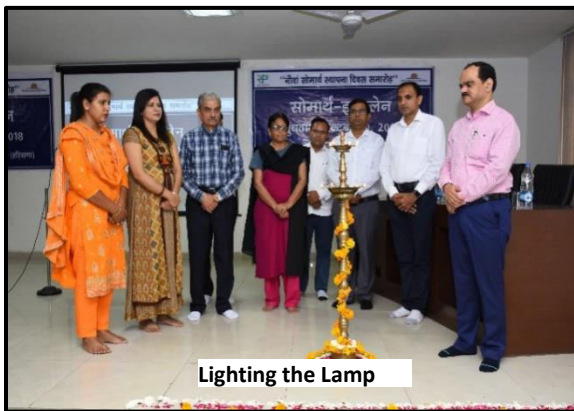
Lighting the Lamp

5. This was followed by lamp lighting , traditional invoking the Goddess of Learning by