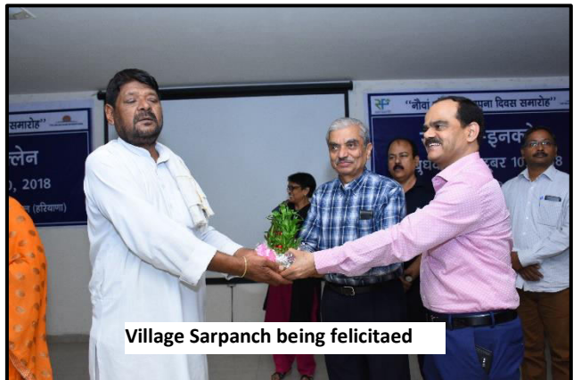
Village Sarpanch being felicitated